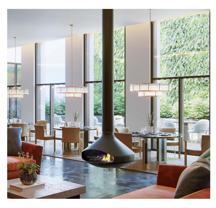
Ergofocus Holographik ® The irreverence of a dream

in WHITE = 19 weeks minimum, starting from receipt of your signed drawing agreement